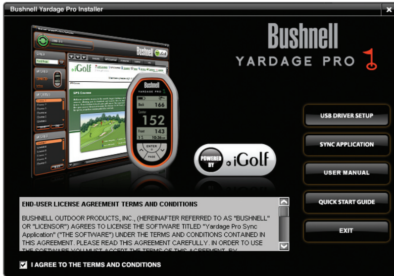
Sync App Installer Screen